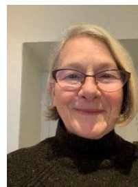
Trustee (Nov 2021)