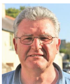
Trustee & SCC Representative